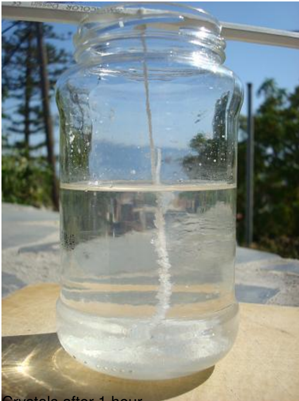
Crystals after 1 hour